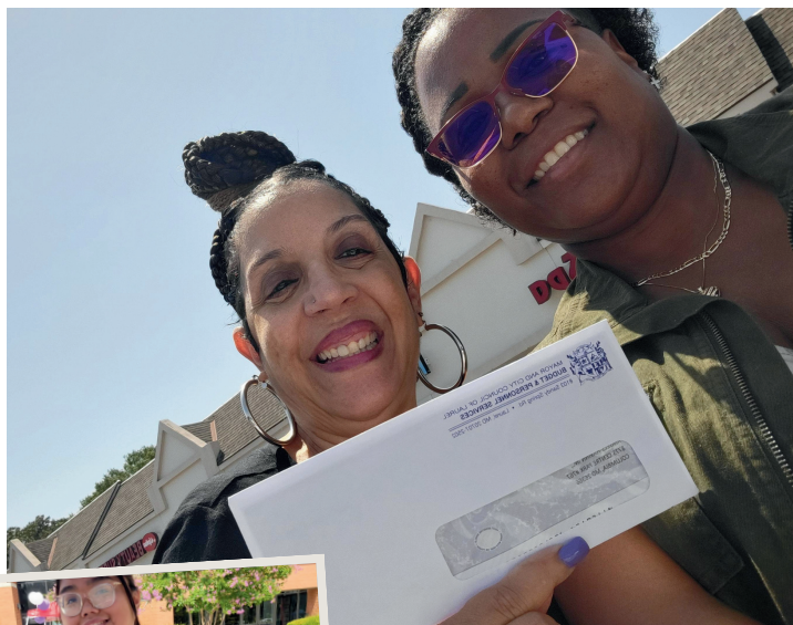
The City is providing a contribution to Angels Havinn to provide school supplies for local children during the back-to-school community pop-up.