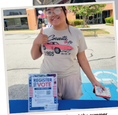
Brand new voter signed up at the summer voter registration drive.

Answer: Yes, it will be held on Saturday, March 8th. More details will be forthcoming, but save the date and plan to attend!