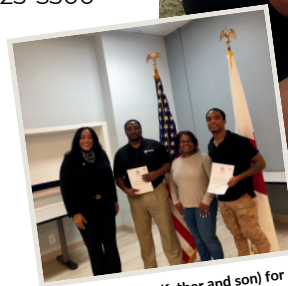
Honoring two Laurel heroes (father and son) for saving a person's life on a Southwest Airlines flight as they received a Presidential award.