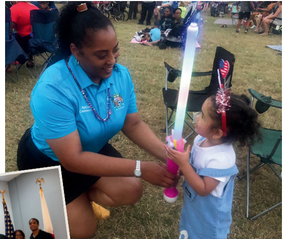
Spending quality time with Laurel youth at our 2024 Fourth of July Celebration at Granville Gude Park on July 6th.